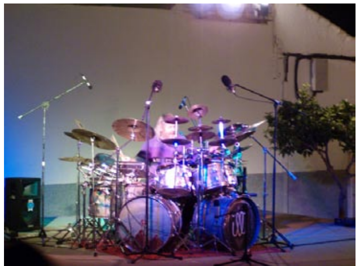
From Illinoise with Love Seite 3