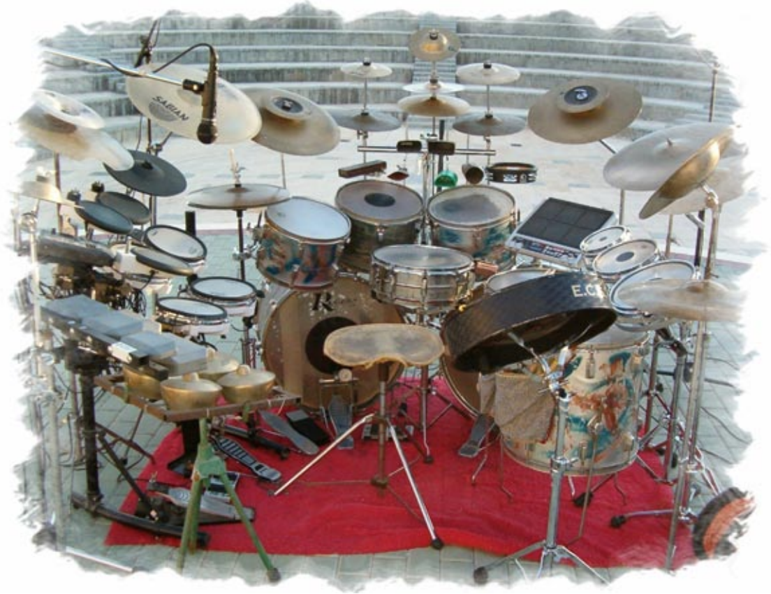
The complete drum set. In the foreground are steeldrums and a set of gamelan gongs. In the middle one can see the electronic drums and the sampler pad.

For the most people a drum set is only a rhythm instrument. But it is actually a great source for marvellous sounds which avoid the dictates of the twelve tones. If we also take in consideration that we can extend the set at will, we have nearly infinite possibilities of creation. I always looked up for sounds which fitted perfectly into my musical imagination instead of trusting into a label. Only in this way I'm provided with the necessary tools for converting my sound worlds in an audible reality. The only thing that counts is the experience of sound.